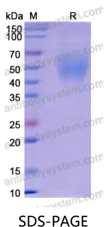
SDS PAGE for recombinant Human CD200R1/OX2R Protein

Anti-Human CD200R1/OX2R Antibody (23ME-00610) binds with CD200R1