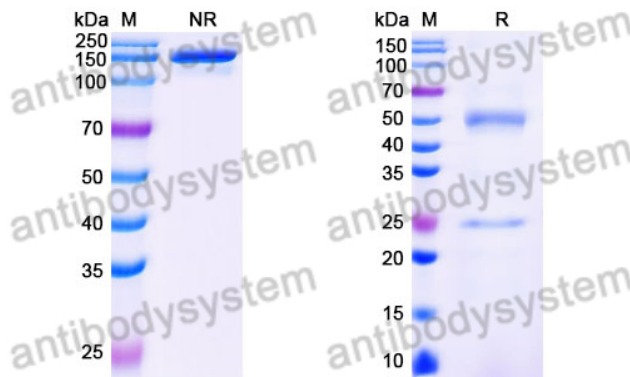
SDS PAGE for Mouse IgG2C Isotype Control Antibody (HyHEL-10)