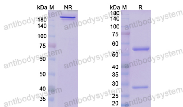
SDS PAGE for Samrotamab

For research use only. Not suitable for clinical or therapeutic use.