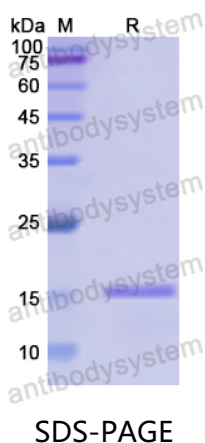
SDS PAGE for recombinant Human GLP1R protein