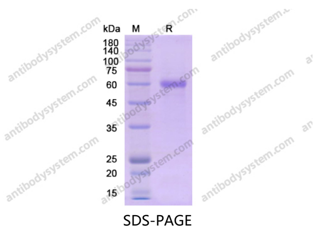
SDS PAGE for recombinant Human CD223 / LAG3