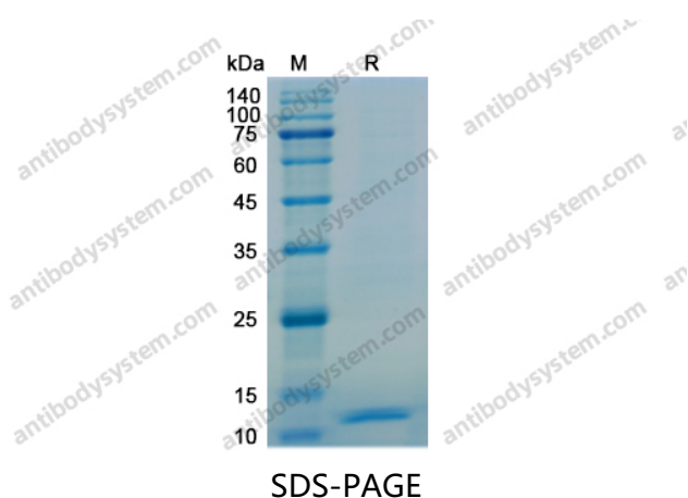
SDS PAGE for recombinant Human CXCL10 / IP-10