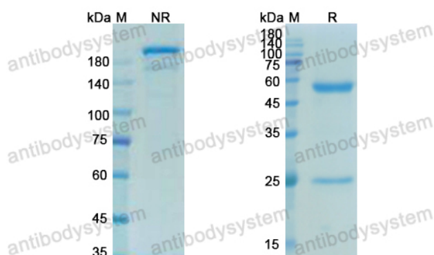
SDS PAGE for Telazorlimab