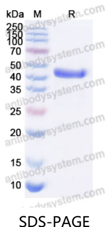
SDS PAGE for pan-Aflatoxin Antibody